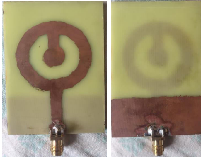
FIG 3: Fabricated Antenna