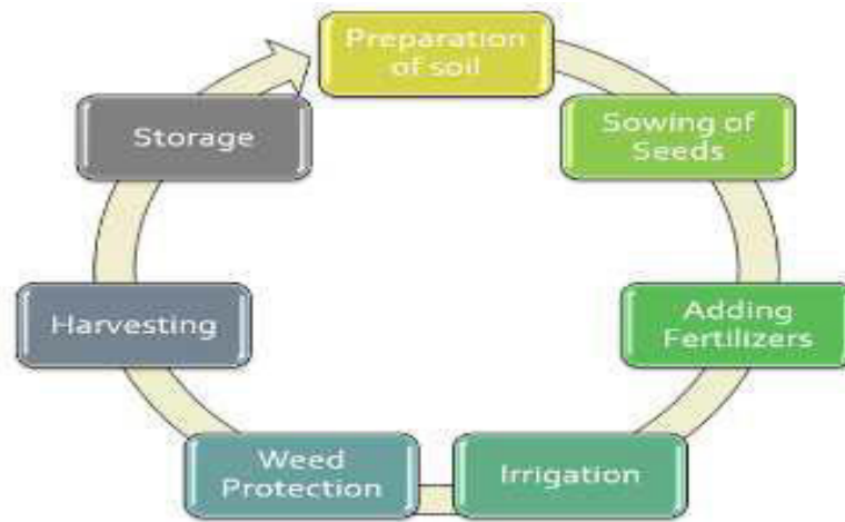
Figure 1 Lifecycle of agriculture [1].