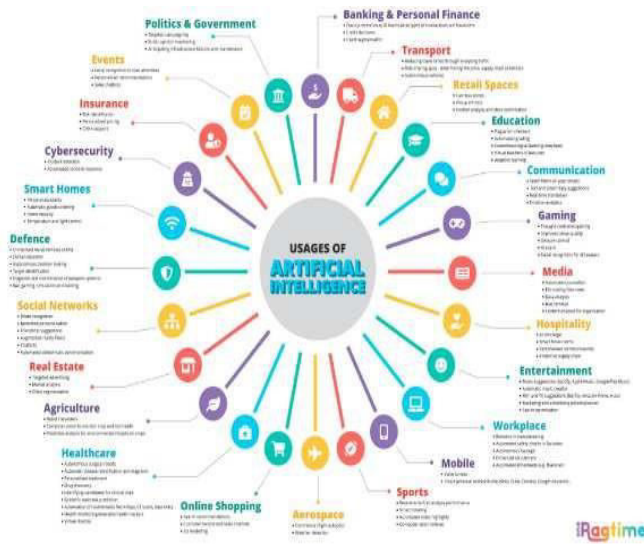
Figure 2 Some areas of applications of AI [2].